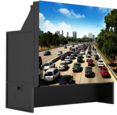
LED Light Source