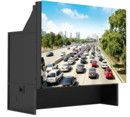
Laser Light Source