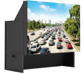
Laser Light Source