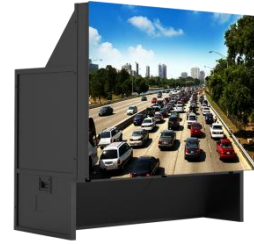
LED Light Source